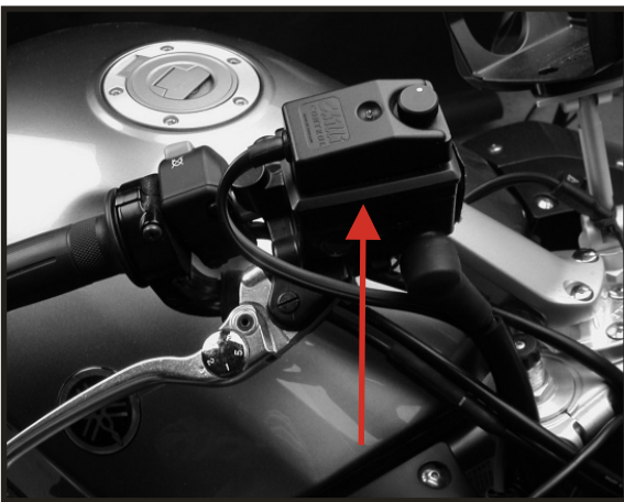
Suggested controller placement.

Wire the heated seat(s) and heat controller(s) per the wiring diagram included in the heated seat(s) wiring kit. This wiring diagram is also available on our website at www.sargentcycle.com/yamwsfjr.htm Wire the heated seat(s) and controller(s) per the wiring diagram, Using the photos below to assist in the installation.