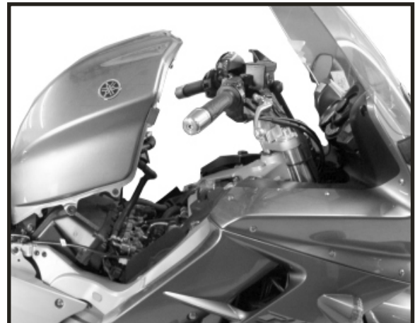
Lift the tank and route wires to the seat.