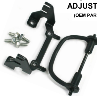
FRONT BRACKET AND ADJUSTER ASSEMBLY (OEM PARTS -NOT INLCUDED)